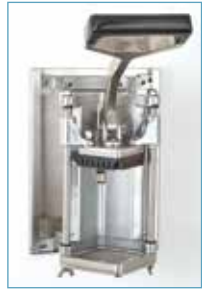
Wall mounted with HFC-BK