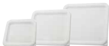
PECC-S, PECC-M, PECC-L