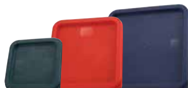
PECC-24, PECC-68, PECC-128