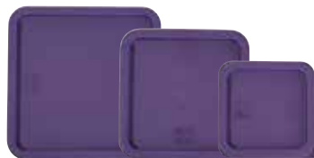
PECC-128P, PECC-68P, PECC-24P

Refer to page 285 for the full Allergen-Free range