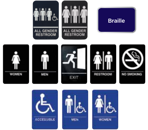
SGNB-SERIES 6" X 9"