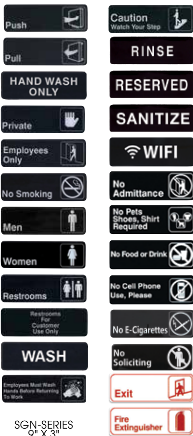
SGN-SERIES 9" X 3"