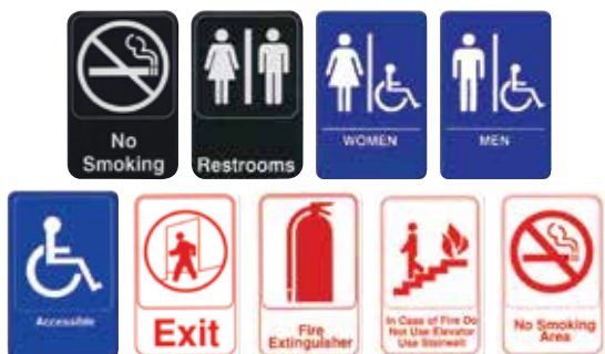
SGN-SERIES 6" X 9"