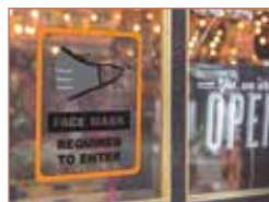
Adheres to inside, legible from outdoors