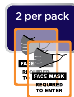
2 per pack