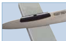
K-4G in use