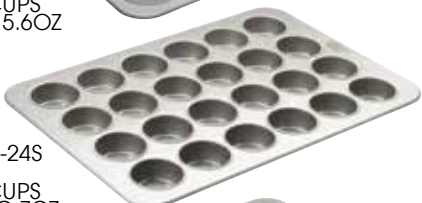
HMF-24S 24 CUPS JUMBO 7OZ