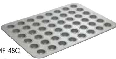
HMF-48O 48 CUPS MINI 1.1OZ