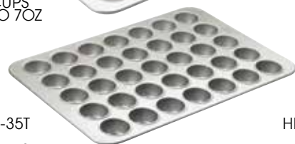
HMF-35T 35 CUPS CUPCAKE 3.8OZ