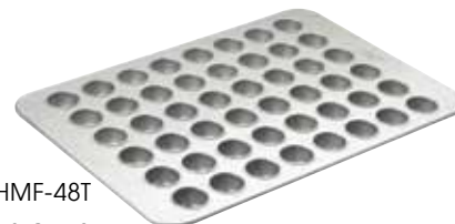
HMF-48T 48 CUPS MINI 2.1OZ