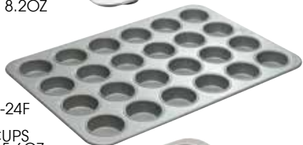
HMF-24F 24 CUPS TEXAS 5.6OZ