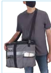
BGCB-1212 worn cross-body