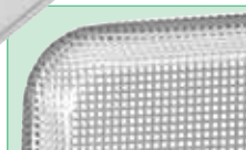
Full edge-to-edge perforation