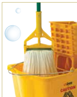
MOPM-M shown with MOPH-7P handle and MPB-36 mop bucket