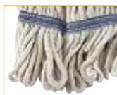
Looped ends prevent unraveling