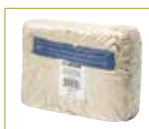
Brick pack is standard