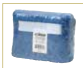
Brick pack is standard