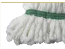
Looped ends prevent unraveling